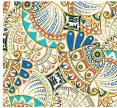
7619-ML 3¾ YDS (backing)